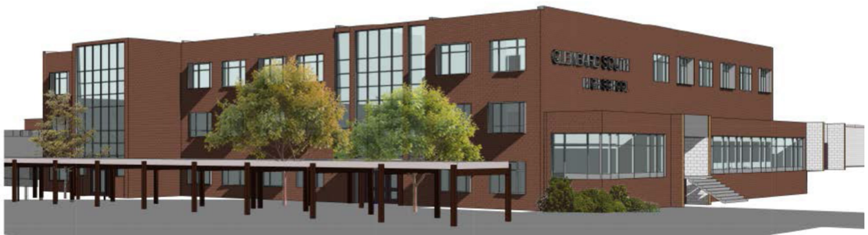
NEW CLASSROOM WINDOWS (WEST ELEVATION)